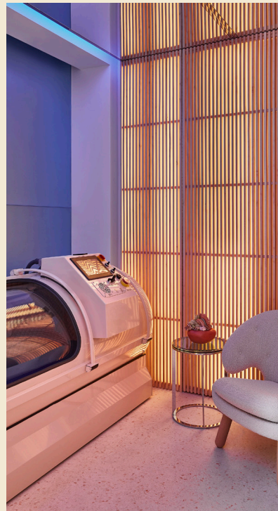
TREATMENTS AND LONGEVITY FLOOR