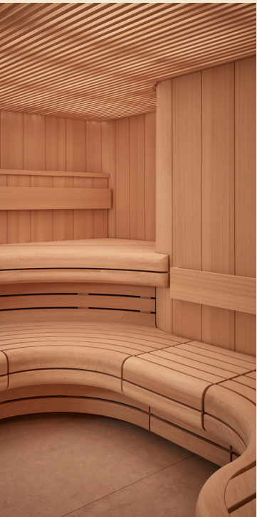
THE WET ZONE

DISCOVER FOUR FLOORS OF SUBTERRANEAN SPACE DEDICATED TO WELLBEING